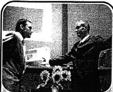
The Yes Men lecturing

For many artists, the use of vehicles (often coupled with advanced technologies) owes much to Krzysztof Wodiczko, who developed many of the milestone ideas of transport-based art.