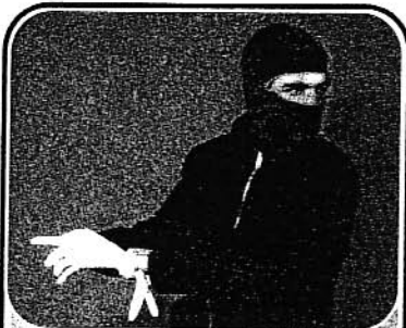
Center for Tactical Magic The Ultimate Jacket