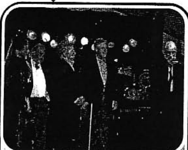
Bill Clinton and Fleetwood Mac

In an era shaped by the phenomenon known as globalism, the aesthetic of tactical intervention has been more warmly received outside the U.S. than in it. However, the dialogue about