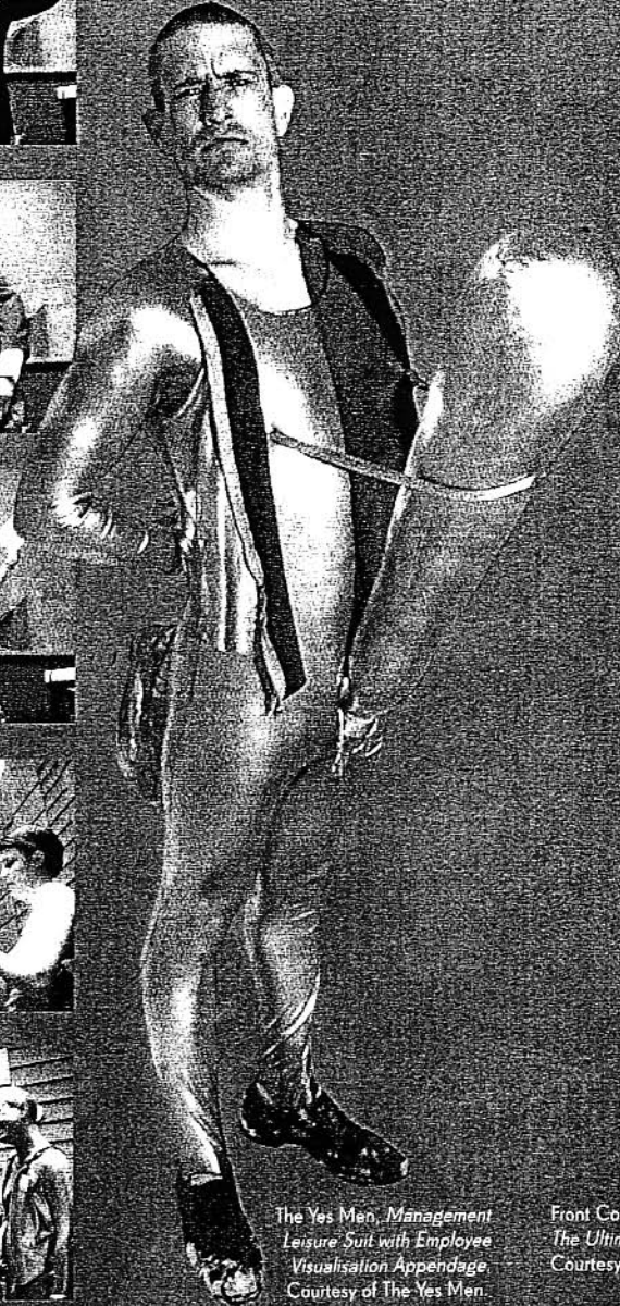
The Yes Men, Management Leisure Suit with Employee Visualisation Appendage